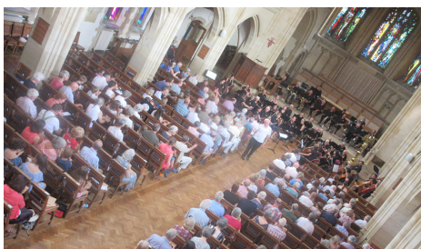
Vince Davy's farewell performance conducting the RPO in Oundle School Chapel at the 2019 Oundle International Festival